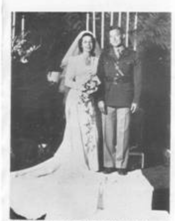
He're and I on our wolding day—Valvation's Die 1943. The baggious see thate together has only desposed over our firsty-nine years of mannion.