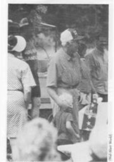
H's a Worsherful Life.