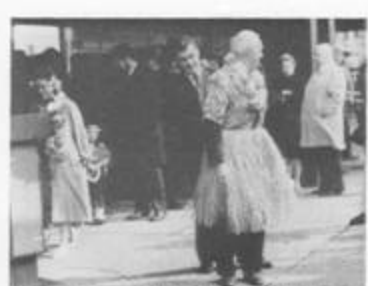
Decid Glass is all too rages to help me don a grass skirt and let so I get ready to keep a processe to "do the beda on Wall Street" in 1984 after we turned in an exceptional year. (Magnir Gillian)