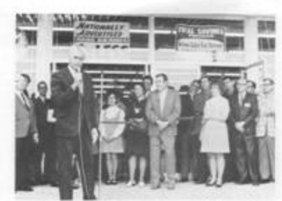
. . . and the customers kept coming. It was particularly satisfying to return to Newport, Arkaman, in 1909 and open Wal-Mart No. 16.