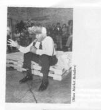
Holes and I were treated to an Approciation Day by our Restauncile foreach and registers in 1993—and the two really polled our all the stops. (Benton County Dody Record)