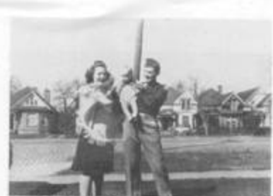
We see a "family" with Bob's hirth to 7044.