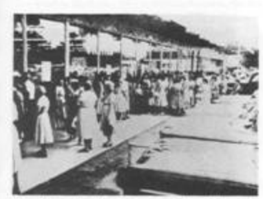
We could all beauthe a bit nature when we saw the crossic line up for the grand opening of the first Wal-Mart in Fogers, Arkannac, on July 2, 1962.