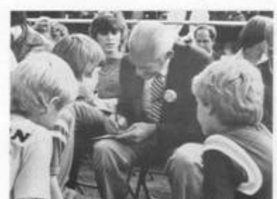
Meeting as many young people as 1 do, I'm optimistic that we can rely on a sound fature generation of leaders—but it's up to all of on to help ensure the right educational apportunities to guarantee it. (Boston County Dody Record)