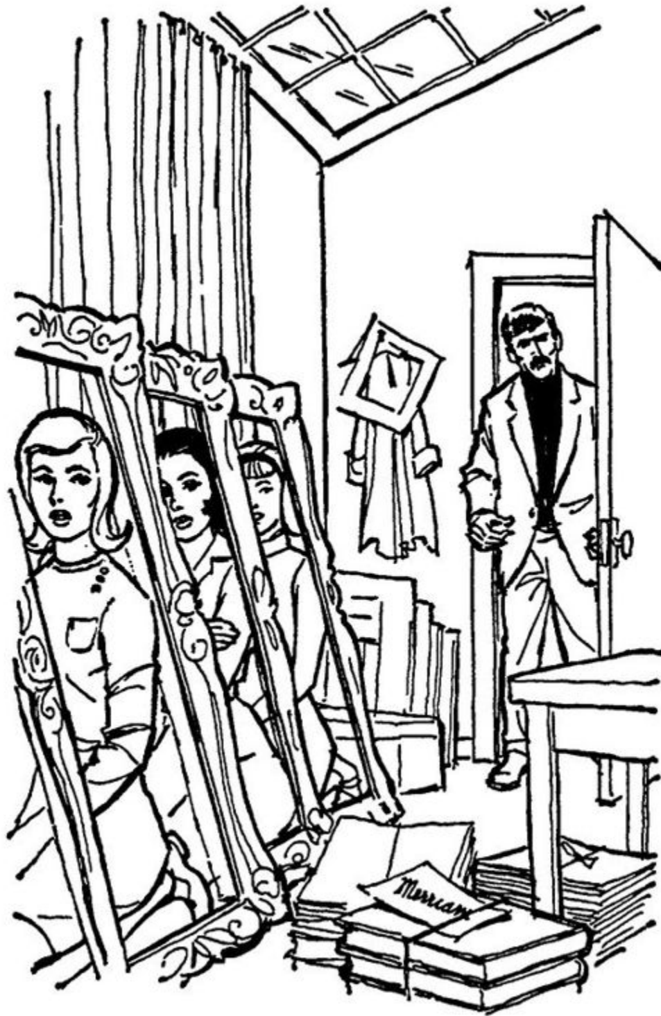
The girls held rigid poses as the intruder entered the room