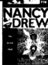
The Orchid Thief