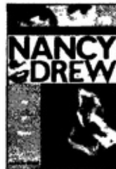
Pit of Vipers

Have you solved all of Nancy's latest cases?