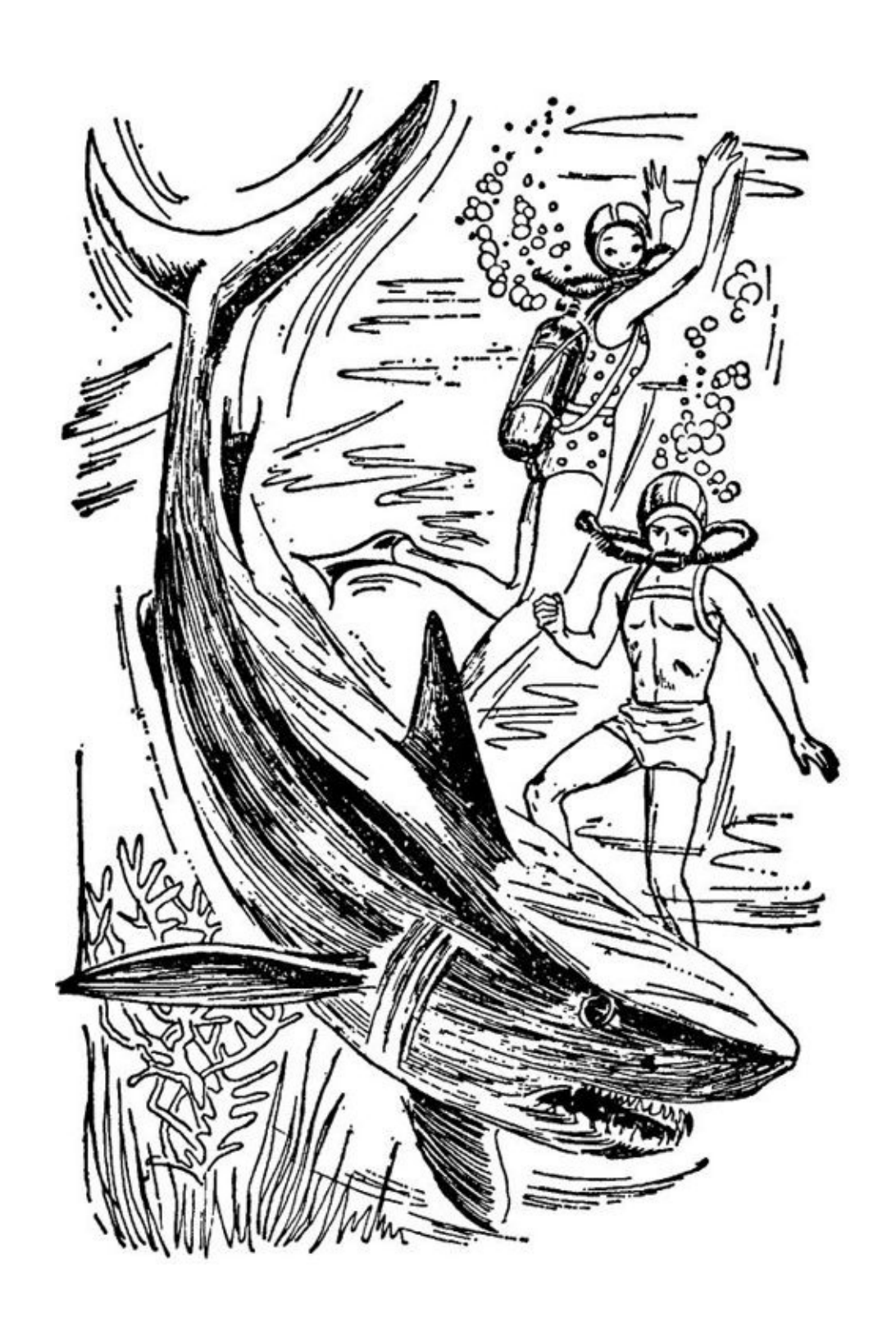
The shark was only a few feet away

"Boy, do I feel silly!" Ned exclaimed. "Well, live and learn!"