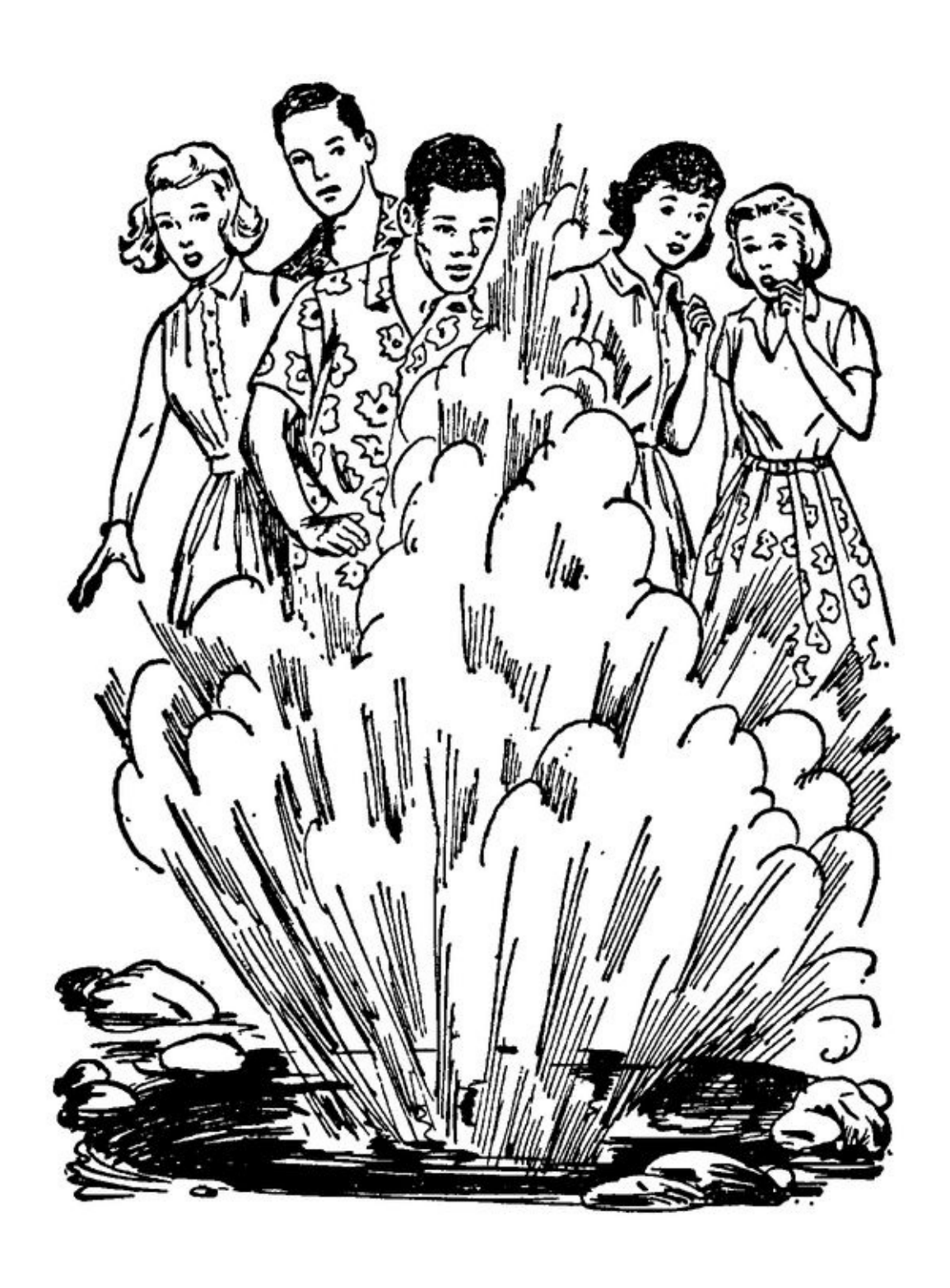
The \ flame \ instantly \ caused \ a \ small \ explosion

After supper the visitors from the mainland walked around the attractively planted grounds, marveling at the steam coming out of the ground in many spots.