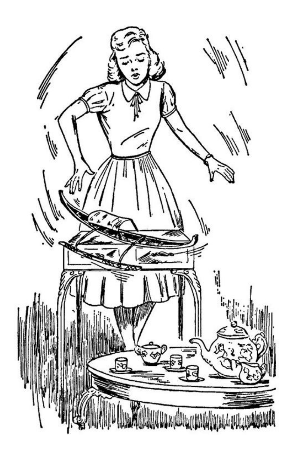
The valuable antique toppled from the stand

the harder to solve the mystery at Kaluakua."