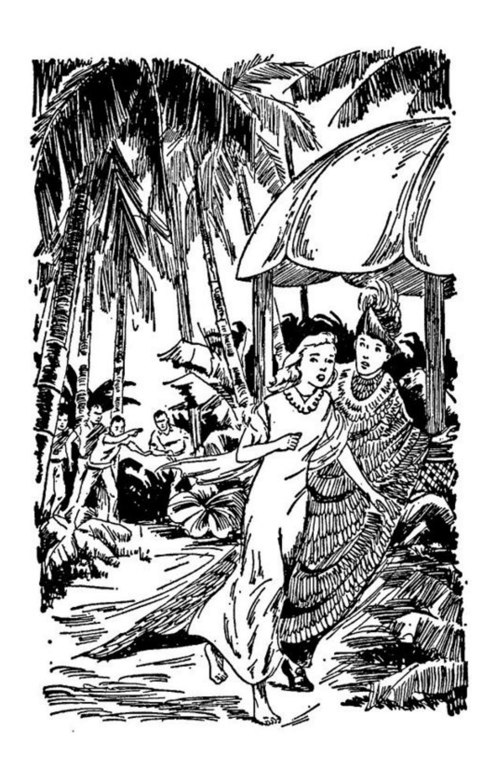
Nancy and Ned tried to escape, but it was too late