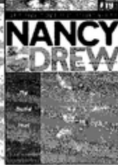
The Orchid Thief