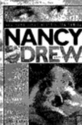
Pit of Vipers

Have you solved all of Nancy's latest cases?