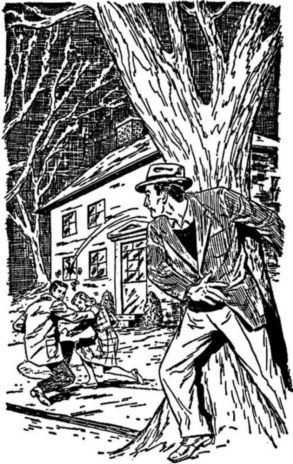
Ned pulled Nancy down to the pavement