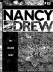
The Dread Thief