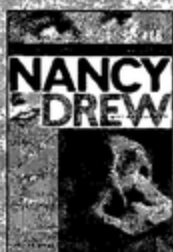
Fit of Vipers

Have you solved all of Nancy's latest cases?