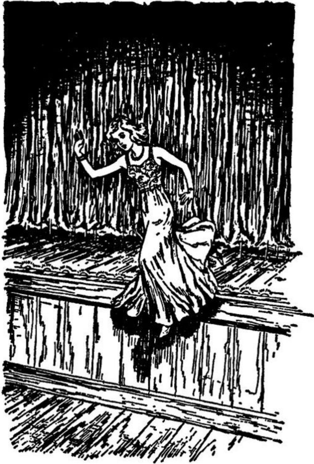
Nancy jumped forward just as the curtain crashed to the floor