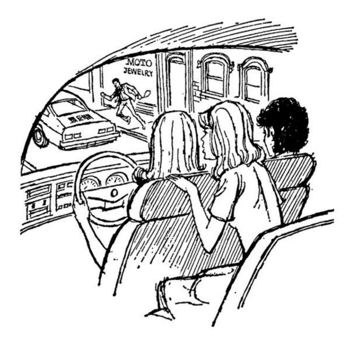
"I'll bet he's a thief!" George cried out.

"Oh dear!" Bess said with a sigh. "There was our chance to be heroines, and we lost it!"