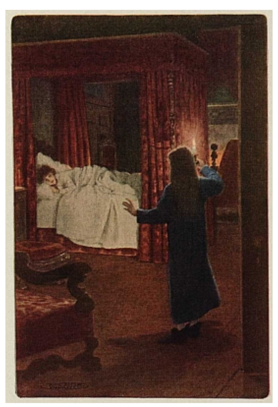
"'WHO ARE YOU?—ARE YOU A GHOST?'"—<u>Page 157</u>

"Who are you?" he said at last in a half-frightened whisper. "Are you a ghost?"