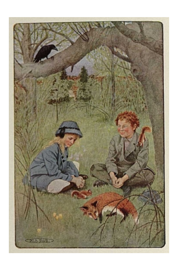
"IT SEEMED SCARCELY BEARABLE TO LEAVE SUCH DELIGHTFULNESS"—