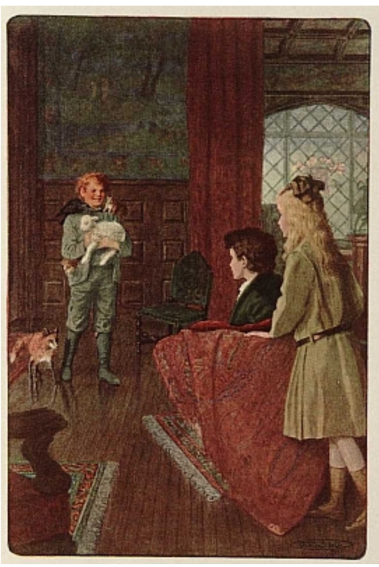
"DICKON CAME IN SMILING HIS NICEST WIDE SMILE."—<u>Page</u> <u>251</u>

Dickon came in smiling his nicest wide smile. The new-born lamb was in his arms and the little red fox trotted by his side. Nut sat on his left shoulder and Soot on his right and Shell's head and paws peeped out of his coat pocket.